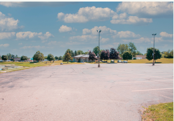
Large Parking Area