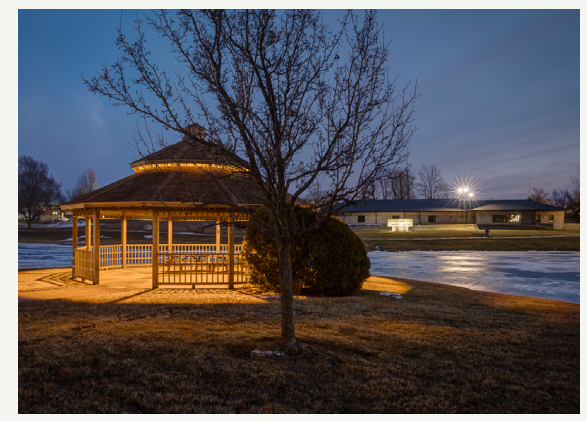
Gazebo and Pond, at Night