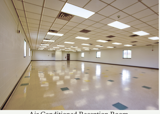
Air Conditioned Reception Room