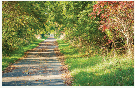
Fred Meijer Heartland Trail