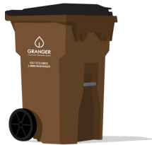
Granger Waste Services

The Village will be selling mattress bags for your convenience at our offices for $8.00.