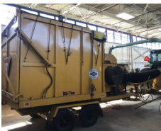
Village of Edmore

piles. When placing your piles at the road please make sure they do not obstruct any drains or sidewalks. Additionally, the DPW asks that you keep your piles at least three feet from any poles (mailboxes, utility poles, fire hydrants). They cannot maneuver the hose on the leaf vacuum around these obstacles.