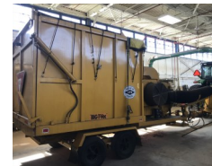
Village of Edmore

poles (mailboxes, utility poles, fire hydrants). They cannot maneuver the hose on the leaf vacuum around these obstacles.