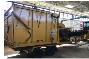
Village of Edmore

piles at least three feet from any poles (mailboxes, utility poles, fire hydrants). They cannot maneuver the hose on the leaf vacuum around these obstacles.