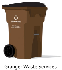
Granger Waste Services